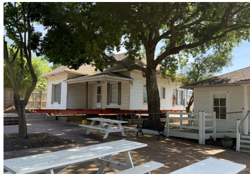
The Winfrey House, newly-deposited in the Ted Ware Plaza

On June 24, 2025, the Winfrey House began its third life, moving from Shadybrook to 619 S. Church St. in the Ted R. Ware Plaza where, after restoration, its front porch will become a stage for the plaza and its rooms will become a storage area for the Grapevine Convention & Visitors Bureau. The Winfrey House is situated just north of the Grapevine Cotton Ginners Museum and across from the International Sister City Friendship Hall (formerly the Ruby Moore